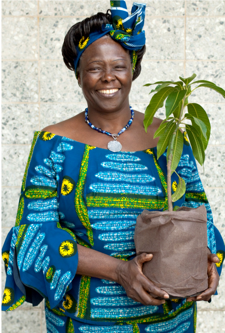
Wangari Maathai 1940-2011 Green Belt Movement

http://www.riqualificazioneurbana.com/en/enjoy-planting/