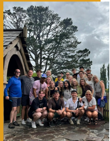
Visiting Hobbiton, January 2024