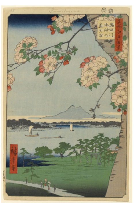
Figure 7. Andō Hiroshige, Suijin Shrine and Massaki on the Sumida River, No. 35 from One Hundred Famous Views of Edo, 1856–1858. Series of 118 polychrome woodblock prints on paper. In the collection of the Brooklyn Museum. PUBLIC DOMAIN

and isolates the building akin to the way that Hiroshige frames the town of Massaki and Mount Tsukuba through the blossoms of the double-petaled cherry in Suijin Shrine and Massaki on the Sumida River (1856) [Figure 7]. In both prints, the middle distance is entirely collapsed. There are many such surprises awaiting those familiar with Berkman's historical influences. Her prints are