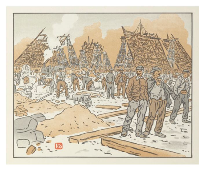
Figure 6. Henri Rivière, Building Site, Eiffel Tower, No. 2 from Thirty-Six Views of the Eiffel Tower, 1888–1902. Series of 36 lithographs printed in four tones on thick-wove paper. In the collection of the Cleveland Museum of Art. © 2021 ARTISTS RIGHTS SOCIETY (ARS), NEW YORK / ADAGP, PARIS

While unique in their capacity to depict this American story of loss and renewal in the physical landscape of New York, there are several ways that Berkman ties her work to that of fellow creators of "thirty-six views." While loosely based on a concept originally carried out by Hokusai, artists Hiroshige, Rivière, and Berkman all strive to depict a singular landmark or place that was iconic to their respective culture and time while framing its magnitude in the wonders of everyday life. We see this attention to the mundane in Hokusai's print Tatekawa in Honjō , which shows a group of laborers stacking planks in the Honjō lumberyard. Mount Fuji can be seen between the planks in the upper right of the print, but we are often too absorbed with the details of the men and their work in the foreground to notice [Figure 5]. Rivière takes a similar approach in Building Site, Eiffel Tower, which shows the initial construction of the Eiffel Tower [Figure 6]. While the tower is certainly important, the viewer cannot help but focus on the labor of the men working at the construction site. Berkman's second print in her series, Building the Plaza, captures this same spirit as