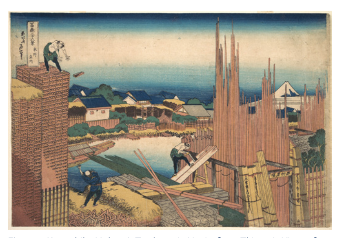
Figure 5. Katsushika Hokusai, Tatekawa in Honjō , from Thirty-six Views of Mount Fuji , 1830–1832. Series of 36 polychrome woodblock prints on paper. Later expanded to 46 prints. In the collection of the Metropolitan Museum of Art. Public Domain