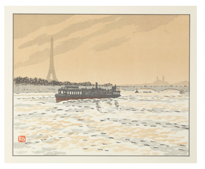
Figure 4. Henri Rivière, From the Quai de la Conférence, No. 8 from Thirty-Six Views of the Eiffel Tower, 1888–1902. Series of 36 lithographs printed in four tones on thick-wove paper. In the collection of the Cleveland Museum of Art. © 2021 ARTISTS RIGHTS SOCIETY (ARS), NEW YORK / ADAGP, PARIS

In some images, we stand with the artist on the metal scaffolding of the tower [Figure 3]. In others, we observe the tower quietly as its silhouette spectrally recedes into the distance and becomes a part of the new Parisian landscape [Figure 4]. Rivière was not interested in a landscape that had always existed, but in a landscape that was in a state of becoming.