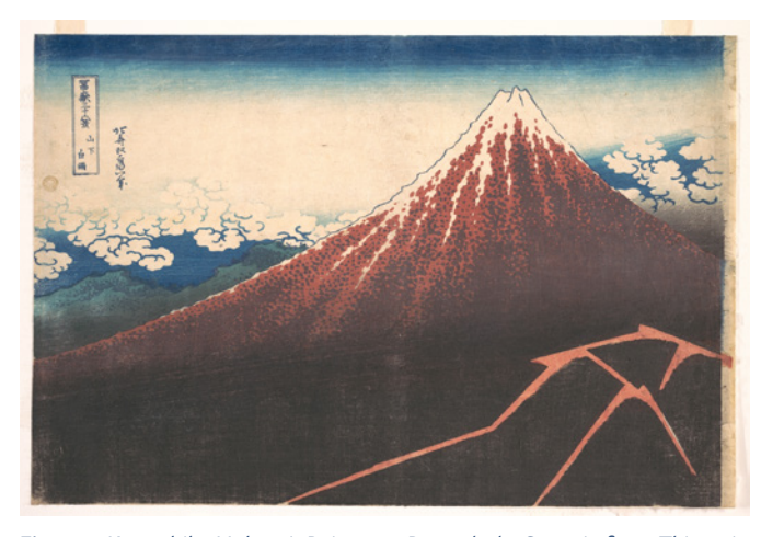
Figure 1. Katsushika Hokusai, Rainstorm Beneath the Summit , from Thirty-six Views of Mount Fuji , 1830–1832. Series of 36 polychrome woodblock prints on paper. Later expanded to 46 prints. In the collection of the Metropolitan Museum of Art. PUBLIC DOMAIN

Despite its powerful iconicity, Mount Fuji formed a part of the everyday landscape for the average person bustling about the capital city of Edo in the seventeenth and eighteenth centuries. While its appearance was subject to conditions of season, weather, and light, it was an ever-present monument in the Japanese landscape and cultural imagination. Hokusai created Thirty-six Views of Mount Fuji (Fugaku sanjūrokkei), one of the most famous representations of the mountain in art history, between 1830 and 1832.3 While the overall shape of the mountain remains consistent throughout the print series, Hokusai manages to capture our visual interest by depicting the mountain from locations both near and far and by documenting its shifting appearance throughout the seasons. At times, the mountain appears large and dominates the composition, such as the majestic ruddy peak featured in Rainstorm Beneath the Summit [Figure 1]. At other times, the mountain is made a small detail in the background as our attention is drawn to a scene of daily life in the foreground. As viewers, we not only perceive the mountain's omnipresence in these prints, but we also engage with the idea of its permanence in the face of nature's capriciousness.