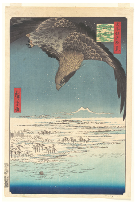
Figure 2. Andō Hiroshige, Jūmantsubo Plain at Fukugawa Susaki, No. 107 from One Hundred Famous Views of Edo, 1856–1858. Series of 118 polychrome woodblock prints on paper. In the collection of the Metropolitan Museum of Art. PUBLIC DOMAIN

names," which were locations with literary and poetic allusion. He was able to address not only conventionally famous places around the capital, but also little-known locations that had topographical or historical interest. In contrast to his earlier work, Hiroshige's One Hundred Famous Views of Edo separates the foreground and the background of the composition. To invoke the