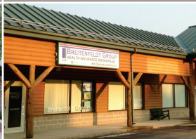
Waite Park, MN Riverwood Mall 2103 Frontage Road N Suite 17