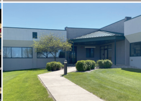
Appleton, WI Evergreen Office Park 3701 E Evergreen Drive Suite 285