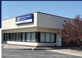
Alexandria, MN 406 3rd Avenue E Suite 300