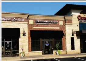
Woodbury, MN Tamarack Hills 755 Bielenberg Drive Suite 107