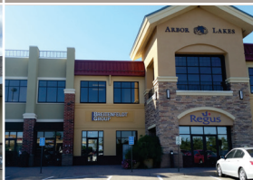
Maple Grove, MN The Fountains at Arbor Lakes 11664 Fountains Drive