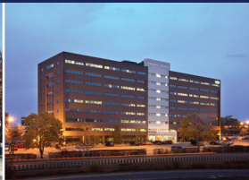
Edina, MN France Place 3601 Minnesota Drive Suite 625