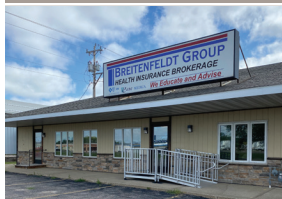
Long Prairie, MN 720 Commerce Road