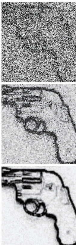
Subjects recognize a gun that gradually comes into focus faster when "primed" with a glimpse of a black face.

ABOUT A 90-MINUTE DRIVE from Eberhardt's office is a police department with a troubled history, in one of the nation's most violent cities. The Oakland police have a long record of scandals. In the late 1990s, four officers calling themselves the Riders would brutalize and plant evidence on people. In a more recent outrage, a group of officers passed around a 19-year-old prostitute. The department has been the target of lawsuits and sanctions, including a $10.9 million payout in a class action lawsuit resulting from the Riders fiasco. The court-enforced agreement also required the department to reform itself, spelling out 51 tasks. In 2014, Eberhardt's group was enlisted to help with task No. 34—