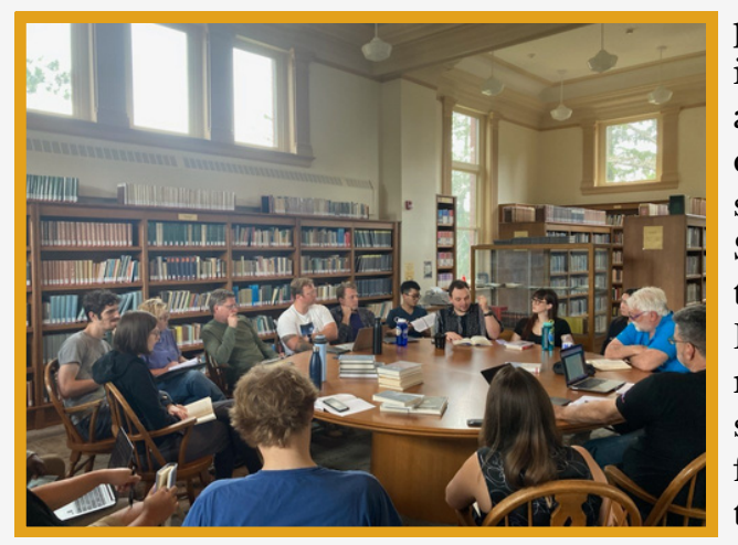
A close-reading with KSI participants, 2023.

The undergraduate research program is aimed at students who are self-motivated and driven to dedicate time to intensive study of Kierkegaard and related thinkers. Accepted students are invited to join a four-week research