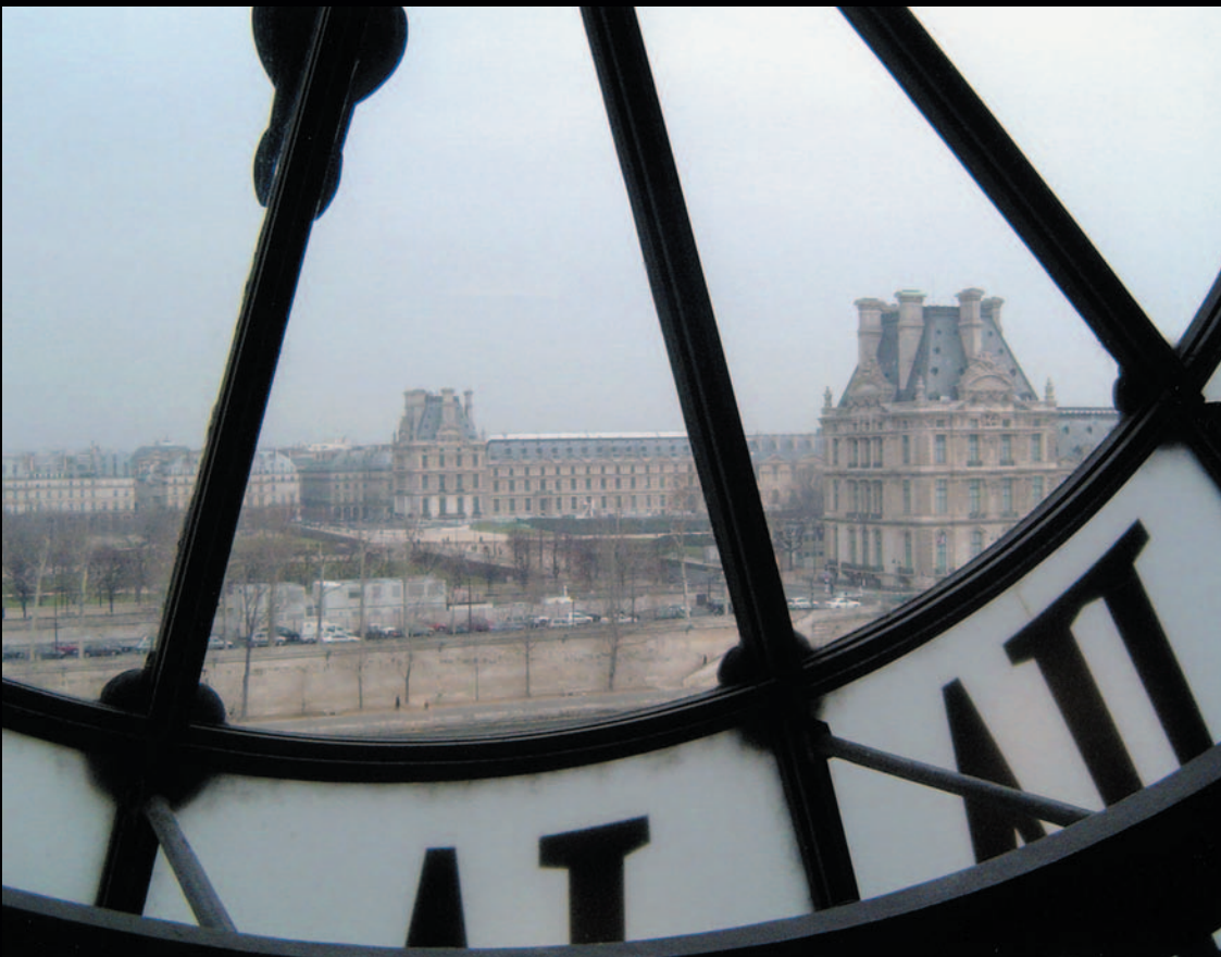
◀ "The Louvre through the Orsay Clock" Lexie Zimelman '07 Rennes Program in France Paris, France

FOR COMMENTS FROM THE PHOTOGRAPHERS, AND TO SEE MORE PHOTOS, VISIT stolaf.edu/ international/photocontest