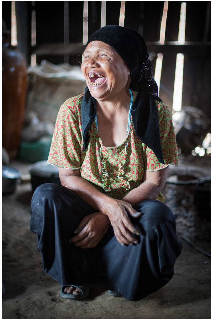
Laughing old woman

When have you experienced a joyful surprise?