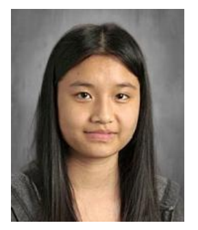
Paw Lae, Humboldt