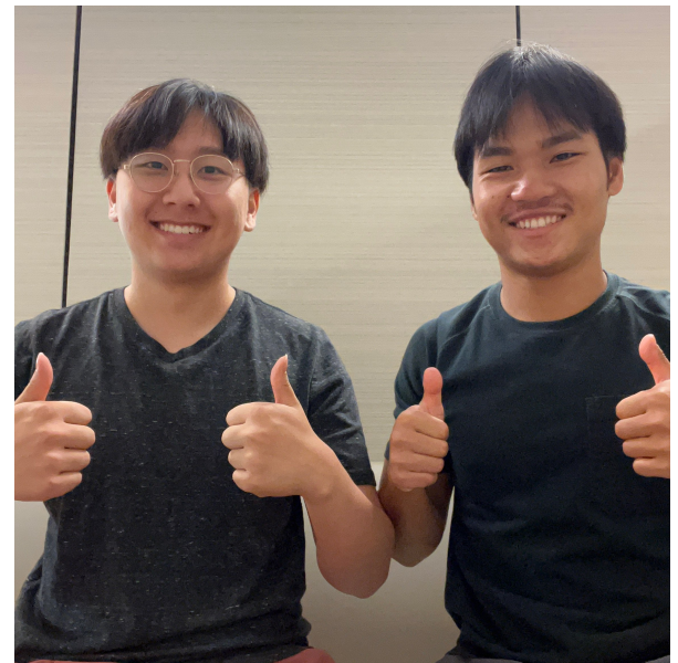
Alumni of our program who are current roommates at St. Olaf College