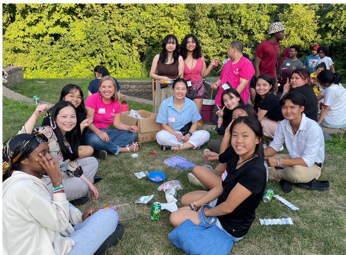
Mentors and UB students taking a quick break from bracelet making with a photo op