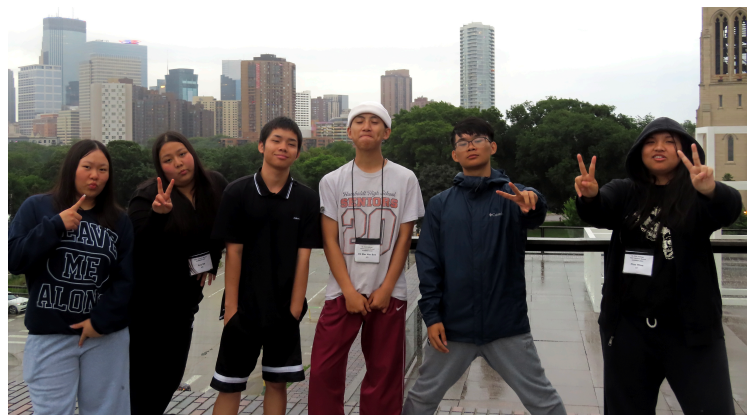
Group picture of Bu's Walker Art Center group.