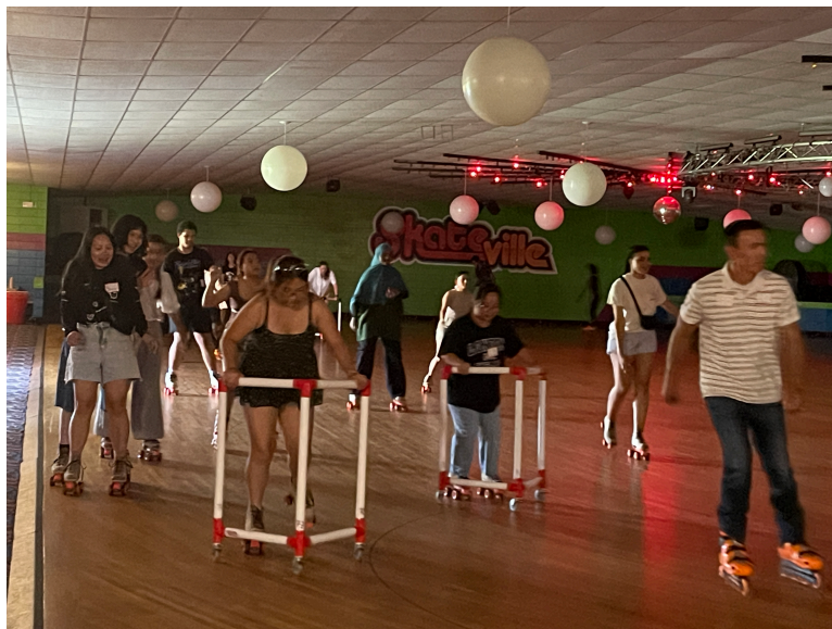
UB students and mentors enjoying their time skating!