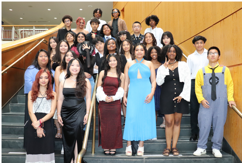
The UB Class of 2025 during the 2024 UB summer banquet.

Keep in mind that there are about eight months of school left before your high school graduation, which is still a lot of time. Senior year is a marathon, not a sprint. Set small goals for yourself every few weeks. They can be as simple as turning in homework on time, to finishing your essay early, to completing a college application weeks before the deadline. These small goals will help you pace yourself with your workload throughout your senior year.