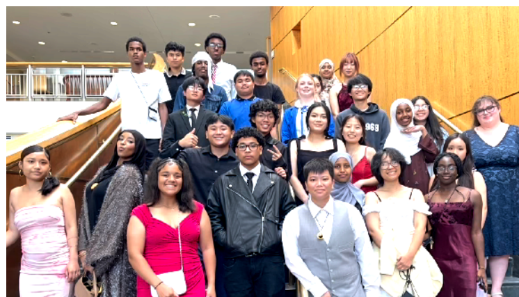
The UB Class of 2026 during the 2025 UB summer banquet.

Seniors, you have worked hard to get to this point. The finish line is within sight, and this year is your chance to finish strong. Stay focused, take care of yourself, and continue to build on the foundation you've created. Your UB advisors are here to support you every step of the way.